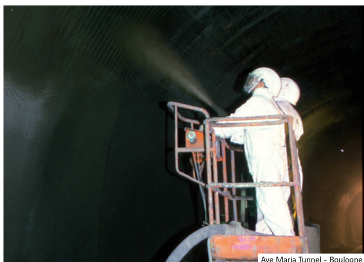
Ave Maria Tunnel - Boulogne