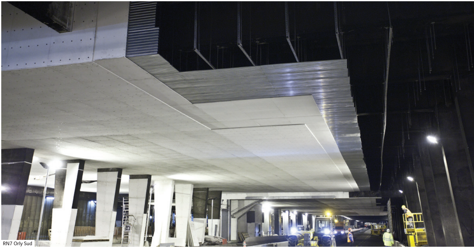
RN7 Orly Sud