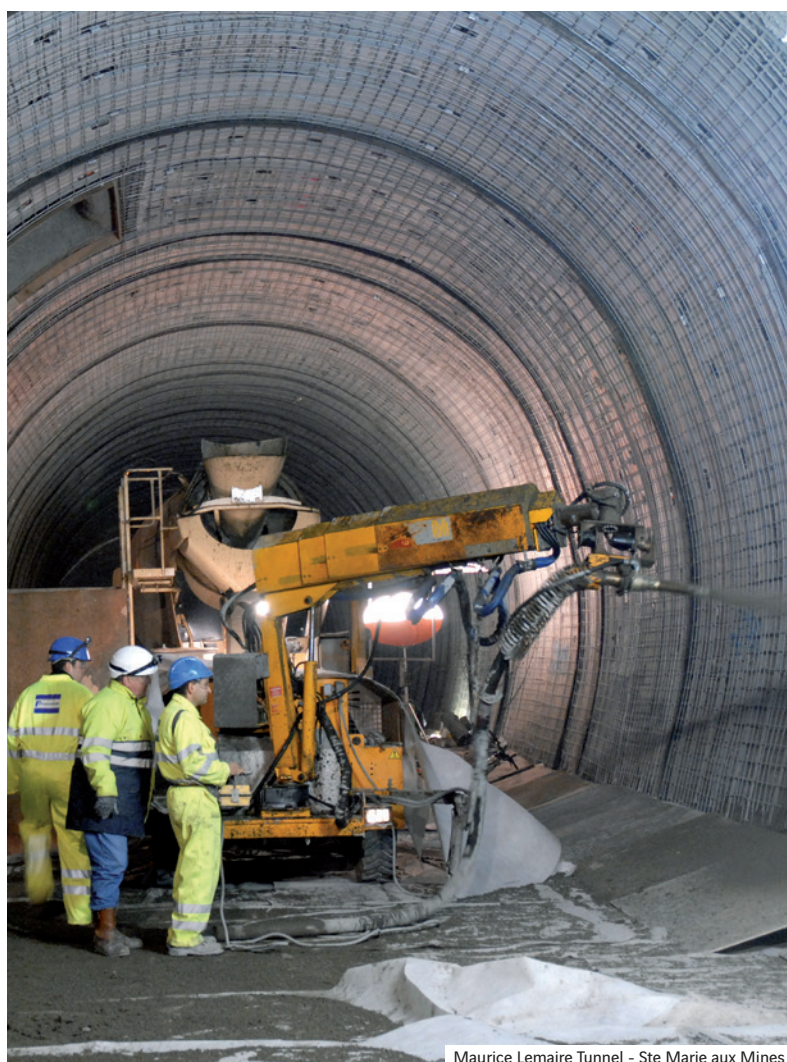
Maurice Lemaire Tunnel - Ste Marie aux Mines