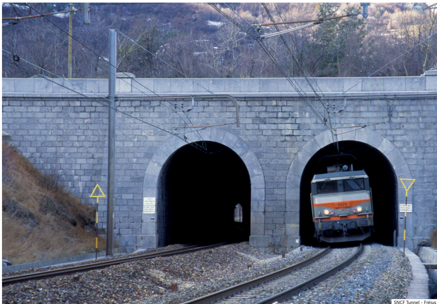
SNCF Tunnel - Fréjus